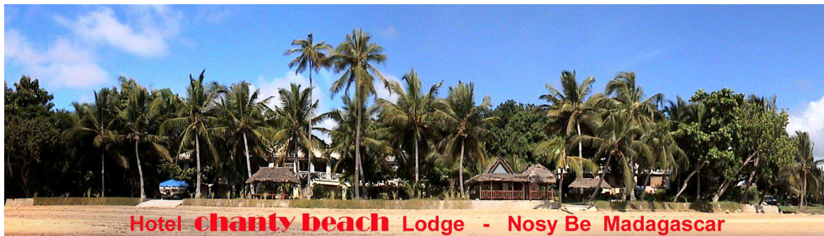
Hotel chanty beach Lodge - Nosy Be Madagascar